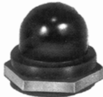
Push Button Boot N-3040

Situation: Grove Industrial Products Group, Shady Grove, PA, probably the first off-road equipment manufacturer to introduce a true rough-terrain articulating boom in the mid 1980s. Now its newest unit, the A60J (articulating boom, 60-foot platform height, and jib-fitted) is a third generation product which replaces previous models. Performance, serviceability, and dependability are customer priorities. Grove has made an extra effort to make the AJ60J as service and user friendly as possible. Central to service and operational friendliness is a SuperFlex Bus control system supplied by OEM Controls. The digital multiplex control system manages all