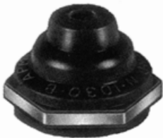
Half Toggle Boot N-1030B